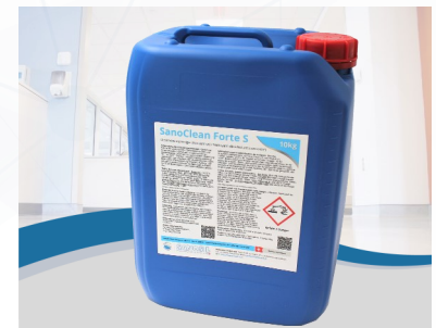
SanoClean Forte S