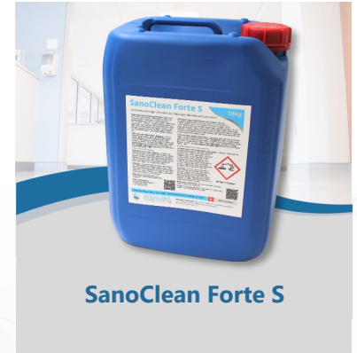
SanoClean Forte S

Important: SanoClean Forte S is a highly concentrated disinfectant and can cause skin irritation – as well as serious eye damage – in its concentrated state. Always wear suitable skin and eye protection (protective gloves / safety goggles).